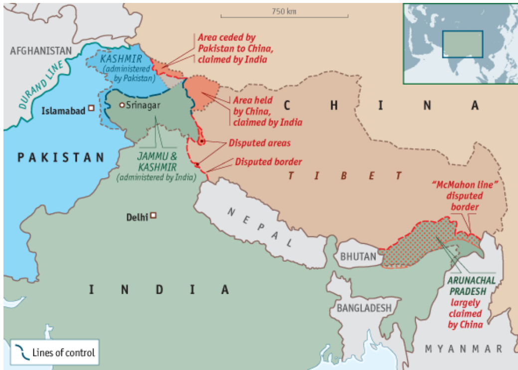
Map: The Sino-Indian Disputed Border Area

over various points on the border between Indian states Himachal Pradesh and Uttarakhand and China's Tibet. The border dispute focuses mainly on the western sector and eastern sector.